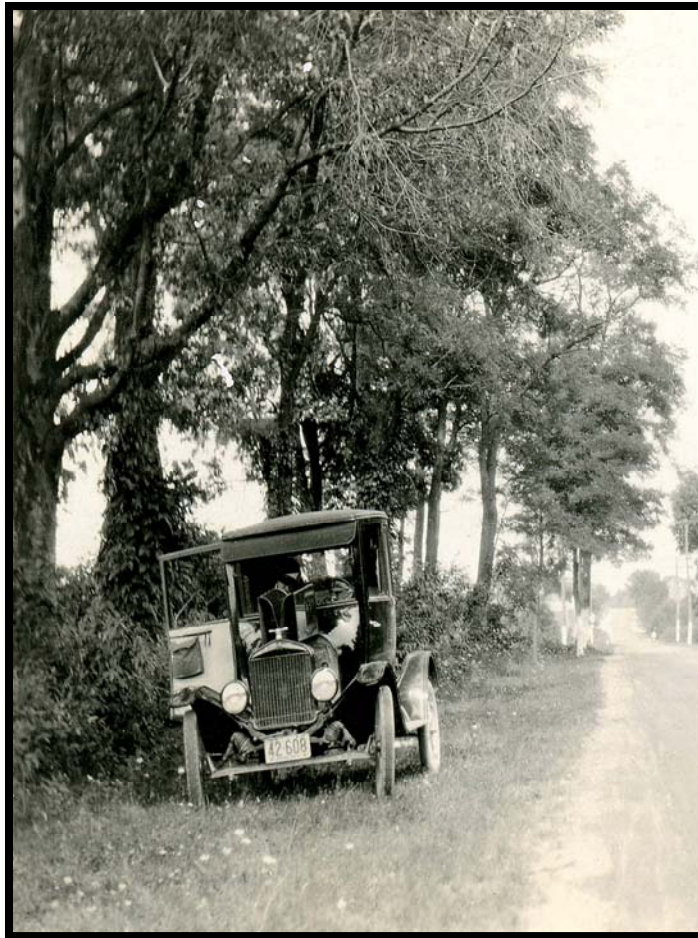
EXHIBIT AT A GLANCE